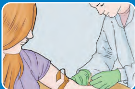
Test for early diagnosis