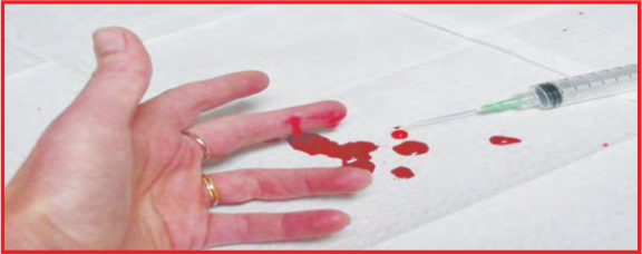
Needle stick injuries infected with hepatitis B and C