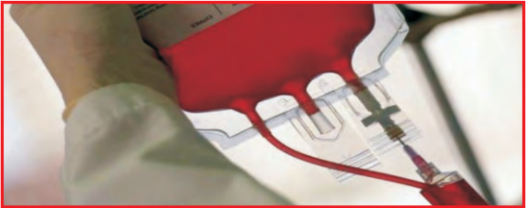
Use of infected blood and blood products