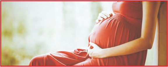
Infected mother to child