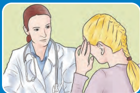
Talk about risk reduction practices